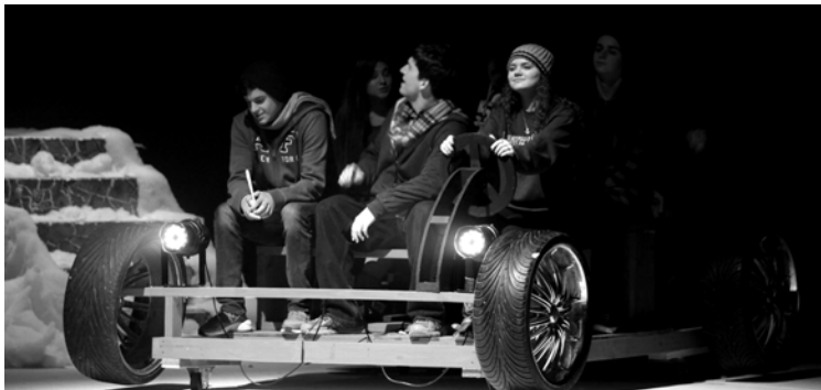
Changes Coming Very soon AHS auditorium will be new home for plays, concerts and other special events for AHS.